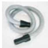
Standard treatment hose