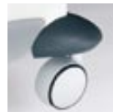
Wheel with brake