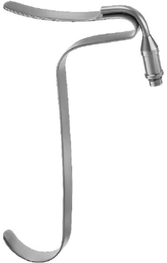
FREEMAN FLAP 20 CMS.