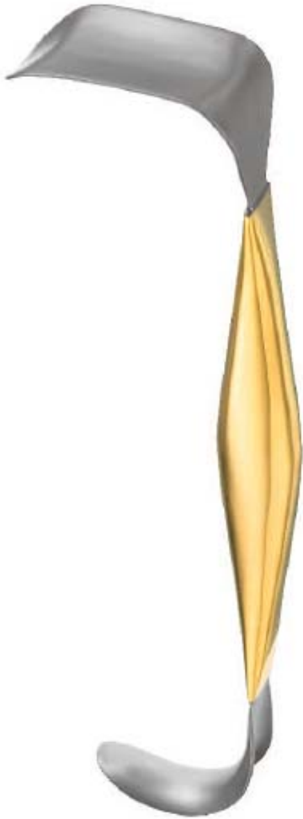
SCULPO 31 CMS. 76.180.31