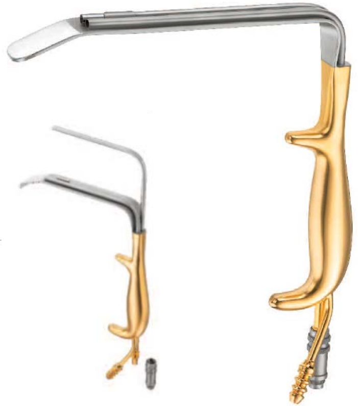
Fibra óptica desmontable